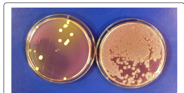
Fig. 1 Contact agar plate cultures showing bacterial colonies recovered from a patient's overbed table before (left) and after (right) the surface was cleaned by a housekeeper using contaminated quaternary ammonium disinfectant. Colonies on right are Serratia marcescens and Achromobacter xylosoxidans

Contamination of disinfectant solutions can occur, particularly if recommendations for their use are not followed [19–21]. For example, Kampf et al. recently reported that 28 buckets from 9 hospitals contained surface-active disinfectants (e.g., quaternary ammonium solutions) that were contaminated with Achromobacter or Serratia strains [21]. Buckets and roles of wipes had not been handled according to manufacturer recommendations. In studies that involved culturing high-touch surfaces in patient rooms before and shortly after housekeepers had performed routine cleaning, we found that cultures obtained from several surfaces in one room after cleaning yielded large numbers of Serratia and smaller numbers of Achromobacter which were not present before cleaning [Fig. 1] [20]. The housekeeper's bucket of quaternary ammonium-based disinfectant contained 9.3 \times 10^4 CFUs/ml of gram-negative bacilli (mostly Serratia marcescens and fewer numbers of Achromobacter xylosoxidans ). Pulsed-field gel electrophoresis demonstrated that Serratia isolates recovered from the disinfectant were the same strains as those recovered from surfaces in the patient room. Genome sequencing of one of the Serratia strains by collaborating investigators revealed that it contained four different qac resistance genes that permitted the organism to grow and survive in the disinfectant (unpublished data). If